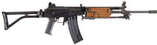
MagLatch Galil 5.56

MagLatch has two modes. Free State and Ban State. MagLatch is to be used in Ban State mode when under state regulation that prohibits detachable magazines with "evil features." Evil features include but are not limited to pistol grips, collapsible stocks, or flash hiders. To switch between modes simply field strip and remove the Modified Magazine and insert a unmodified magazine and reassemble firearm. Modified Magazine is Ban State mode. Unmodified Magazine is Free State mode. If using Free State mode while in a ban state you have constructed an illegal "Assault Weapon." By installing this device, the user of this product assumes all risks and liabilities. MagLatch and its affiliates are not responsible for the action or improper use of this product by the user.