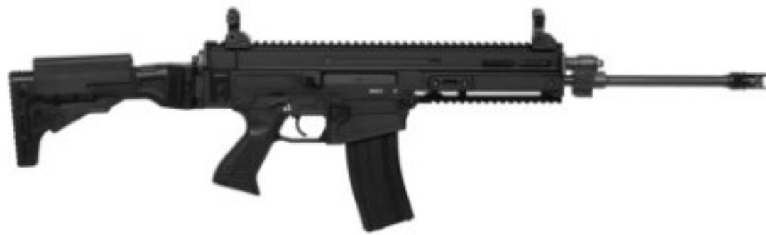
MagLatch CZ 805 Bren

MagLatch has two modes. Free State and Ban State. MagLatch is to be used in Ban State mode when under state regulation that prohibits detachable magazines with "evil features." Evil features include but are not limited to pistol grips, collapsible stocks, or flash hiders. To switch between modes simply separate your upper and lower receiver and rotate the set screw then reassemble firearm. With MagLatch 805 Bren rotated counter-clockwise you are in Ban State mode. With MagLatch 805 Bren rotated clockwise you are in Free State mode. If using Free State mode while in a ban state you have constructed an illegal "Assault Weapon." By installing this device, the user of this product assumes all risks and liabilities. MagLatch and its affiliates are not responsible for the action or improper use of this product by the user.