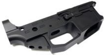
MagLatch 9/40 10/45

MagLatch has two modes. Free State and Ban State. MagLatch is to be used in Ban State mode when under state regulation that prohibits detachable magazines with "evil features." Evil features include but are not limited to pistol grips, collapsible stocks, or flash hiders. To switch between modes simply separate your upper and lower and remove 1/16" allen screw retaining the magazine release. MagLatch plug in is Ban State mode. MagLatch plug out is Free State mode. If using Free State mode while in a ban state you have constructed an illegal "Assault Weapon." By installing this device, the user of this product assumes all risks and liabilities. MagLatch and its affiliates are not responsible for the action or improper use of this product by the user.